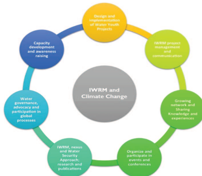
Figure 1. Thematic Group of IWRM project

IWRM involves many tools (Figure 1) and scenarios of water management, but no single blueprint of it fits every situation. Regardless of this reality, the practice of IWRM has a structure that can be expressed as a theory for how to apply it. The IWRM Thematic Group aims to support the water management and sediment in an efficient and structured way by setting up seven main priorities. These are as follows: (i) IWRM project management and communication, (ii) Growing network and Sharing Knowledge and experiences, (iii) Organize and participate in events and conferences, (iv) IWRM, nexus and Water Security Approach; research and publications, (v) Water governance, advocacy and participation in global processes, (vi) Capacity development and awareness raising, and (vii) Design and implementation of Water Youth Projects.